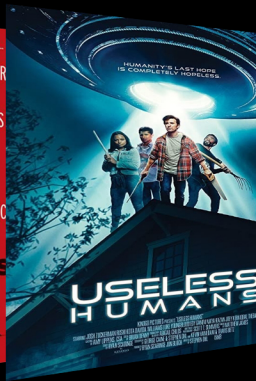
Useless Humans (Original Score) Prime