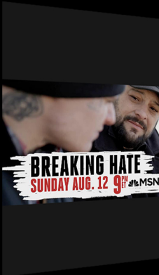
Breaking Hate (Original Score) MSNBC