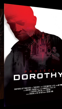
Project Dorothy (Original Score) TBD