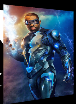
Black Lightning (Additional Writer) WB