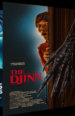
The Djinn (Original Score) TBD